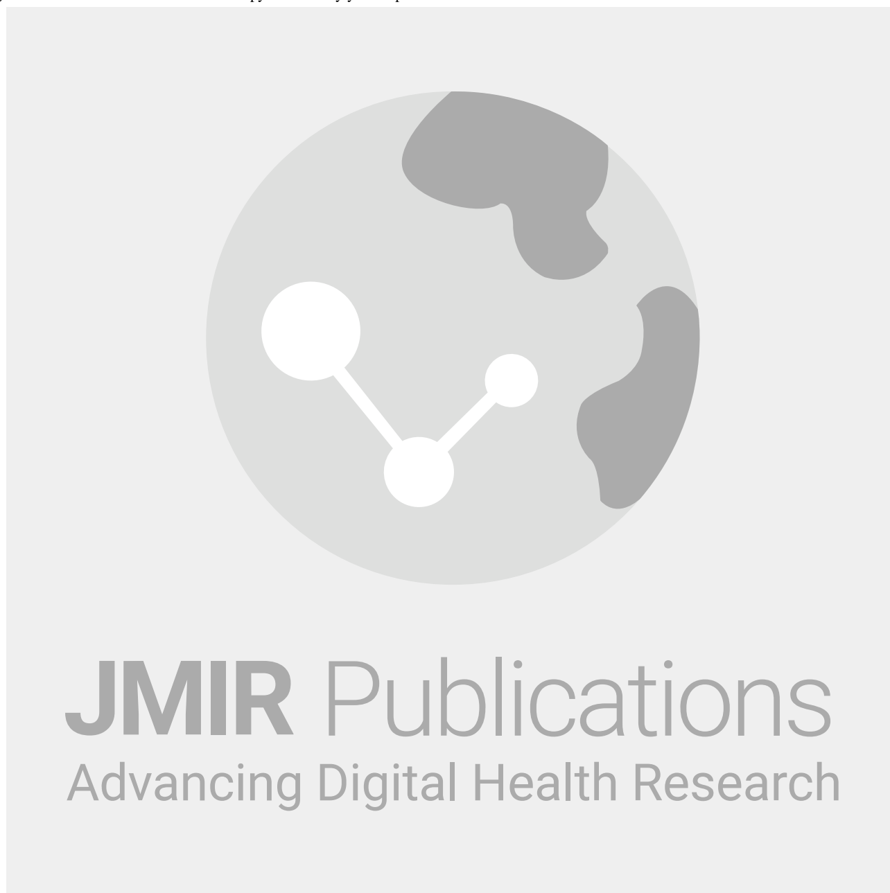
Figure 1. Search terms “Web-based Therapy” trended by year of publication

Interest in use of the Internet and Web-based interventions is increasing rapidly. In the 7-year period from 1996 to 2003, a total of 569 citations demonstrated a twelve-fold increase in MEDLINE publication citations for “Web-based therapies,” from 13 citations in 1996 to 152 citations in 2002. There has also been a steady increase in the number of citations in MEDLINE for the term “Web-based intervention,” further indicating interest in this research area for Web-based treatments. In addition to completed patient-focused, Web-based intervention studies, a large number of the publications are simply proposed or newly implemented studies. Many studies are based on therapeutic interventions that are provider focused and part of an implemented system incorporating the use of computerized medical records. Others include telehealth technologies that include highly technically interfaced lab values recorded within a case managed setting. Others discuss the variety and integrity of health-related Web sites (Figure 1).